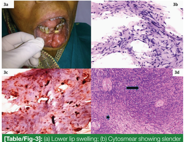
spindle cells in a fibrillary matrix (PAP,400X); (c) Immunocytochemistry revealing the spindle cells are diffusely immunopositive for S100 (400X); (d) Histopathology of the same, revealing cellular(Antoni A) and paucicellular myxoid (Antoni B) zone. (H & E 100X).

The aspirate was scanty and revealed spindle cells arranged in tissue fragments and discretely. The nuclei were slender with pointed ends and at foci nuclear buckling was noted. The tissue fragments showed foci of nuclear palisading